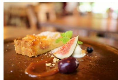
Focal Length: 35mm Exposure: F/2.8 1/25sec ISO:800

The MOD (Minimum Object Distance) for the 20mm, 24mm and 35mm is 0.11m, 0.12m and 0.15m (4.3, 4.7 and 5.9 in) respectively. Plus, the maximum magnification ratio for all three is 1:2 so you can fill the frame, even when shooting small objects. You'll never again be frustrated because you cannot get close to an object while shooting. This remarkable performance allows users to create compositions that exploit dramatic perspective (closer subjects are larger, and distant ones are smaller). With a fast F/2.8 aperture you can produce a one-of-a-kind photo and leverage the beautifully blurred background bokeh.