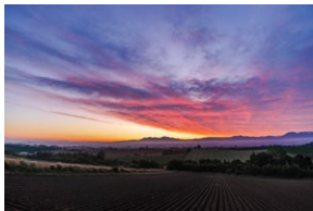
Focal Length: 20mm Exposure: F/2.8 1/40sec ISO:100