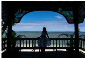
Focal Length: 24mm Exposure: F/10 1/1250sec ISO:200