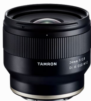
24mm F/2.8 Di III OSD M1:2 (Model F051)