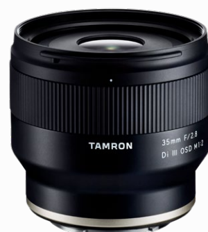
35mm F/2.8 Di III OSD M1:2 (Model F053)

for Sony full-frame mirrorless For Sony E-mount Di III: For mirrorless interchangeable-lens cameras